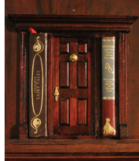
8. Nicola's Books