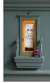
5. Peaceable Kingdom Still there, for now, though store is closed.