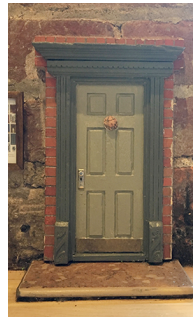
4. Sweetwaters Coffee & Tea