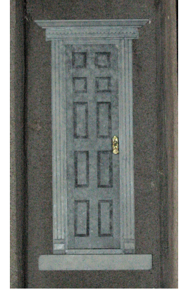
A Goblin Door

I do not like to reveal the location, because it does not seem wise to encourage people to be monkeying about a goblin door. It seems that a goblin or goblins have made this out of jealousy of the urban fairies. Obviously goblins because of the unseemly location (pigeon poo and cigarette butts) and tall proportions of the door.