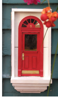
3. Red Shoes