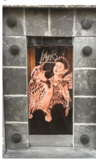
2. The Ark New Façade