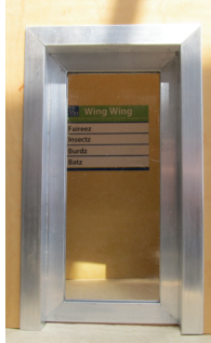
7. UofM Mott's Children's Hospital