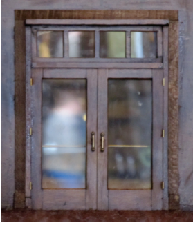
1. Michigan Theater