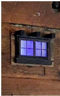
6. Found Gallery Window

I do not like to reveal the location, because it does not seem wise to encourage people to be monkeying about a goblin door. It seems that a goblin or goblins have made this out of jealousy of the urban fairies. Obviously goblins because of the unseemly location (pigeon poo and cigarette butts) and tall proportions of the door.